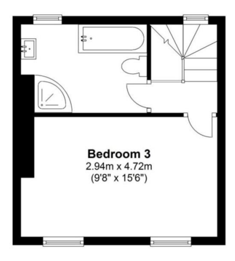
6 High Market Place, Kirkbymoorside

Approx. 25.1 sq. metres (269.7 sq. feet)